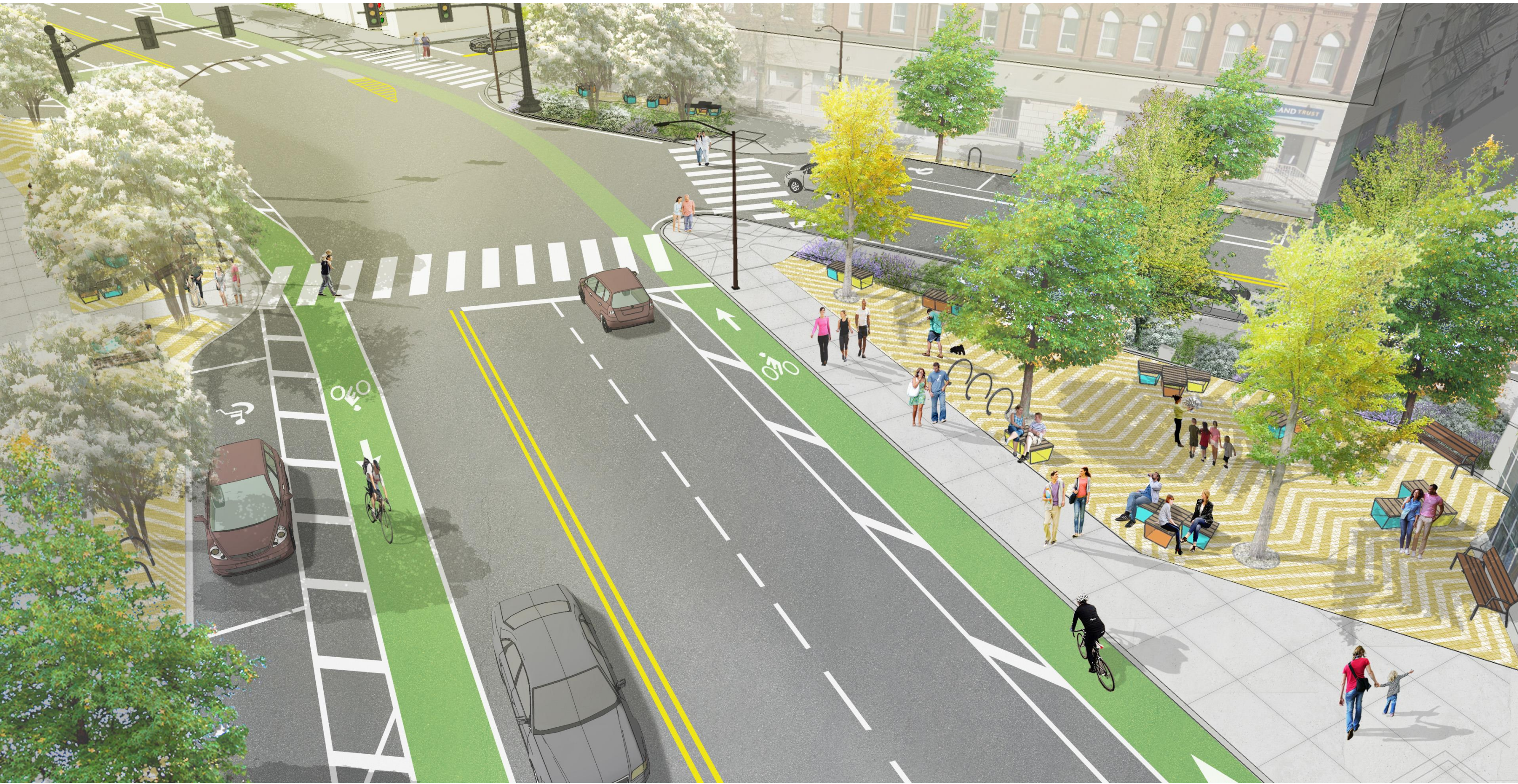
West Newton Square Enhancements Project